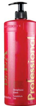
Applicator Cream 1