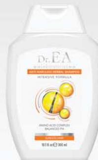
For Sunless Hair