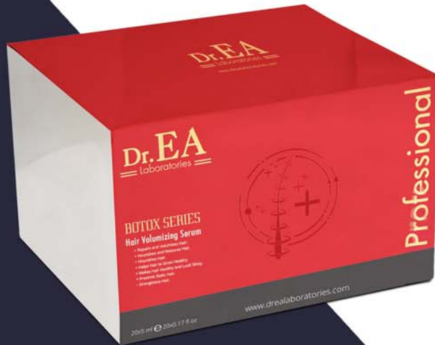
Hair Volumizing Serum (20 Ampoules)