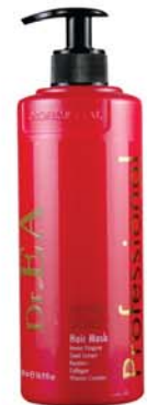
Stabilizing Hair Mask 2