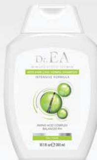
For Oily Hair